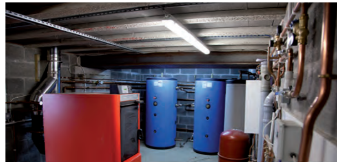
• biomass boiler and thermal store in plant room

Preliminary assessment of wind technology was also considered as an option for the future. CHP and heat pumps were also considered but deemed not practical. Specialist software tools including SAP, Design Builder, PV-sol and Code for Sustainable Homes Water Calculator were used to specify the size of the systems.