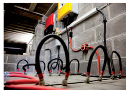
• battery bank and solar inverter