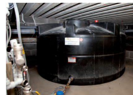
• rainwater storage

The wood gasification boiler chosen for the scheme uses the process of gasification to convert wood into wood gas which is then burnt cleanly and efficiently. The wood gas is precisely mixed with air utilising the in-built lambda control so the superheated mix results in complete combustion which leaves little or no ash. The heat is then transferred to two separate heat stores and drawn on by the family when required.