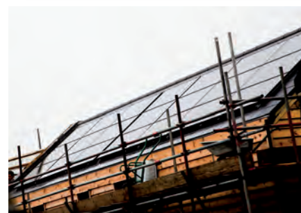
• solar PV on roof