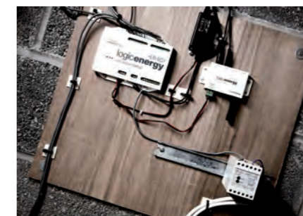
• smart meter collection points