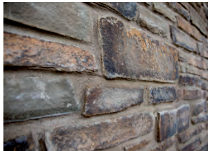
• Traditional stone craft on cladding