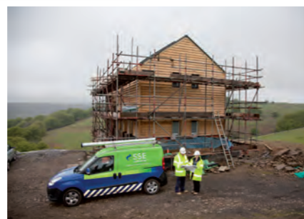
• wood cladding over thermal insulation